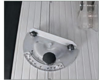
precision mitre guide