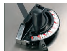
Heavy duty cast mitre guide