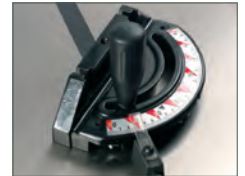
Heavy duty cast mitre guide