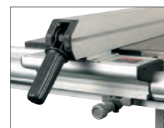
Quick-lock adjustable rip fence

"After setting up, trial cuts were very impressive. Being able to crosscut 8' x 4' sheets make this saw an exceptional piece of equipment. When you consider the cost of the whole set-up (saw & sliding carriage) - bearing in mind the superb quality and large capacities..... Highly recommended."