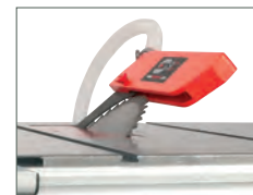
Accurate 0° - 45° arbor