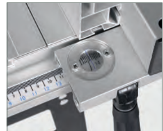
fence adjustment scale