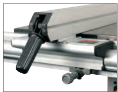
Quick-lock adjustable rip fence

Legs are included as part of Sliding Carriage (01447)