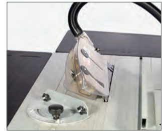
Accurate 0° to 45° tilting arbor