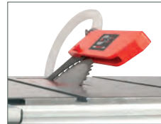
Accurate 0° - 45° arbor