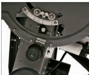
Accurate 0° - 45° tilting arbor