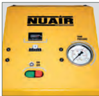
06223 - control panel