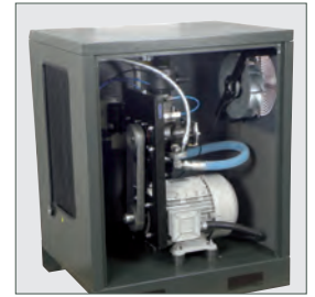
Saturn - inside (rear)