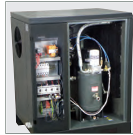
Saturn - inside (front)