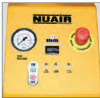
06224 - control panel