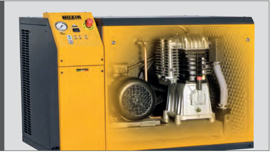
extra quiet operation